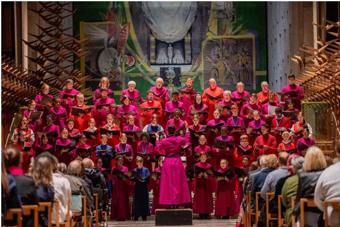
Cathedral Music Trust Diamond Fund concert in 2021

The Cathedral Choir - Two separate treble choirs (19 boys and 26 girls at present) who sing regularly by themselves and with the back rows, consisting of choral scholars, and volunteer and professional clerks. The Cathedral Choir is one of the most diverse choirs in the country and we are proud to recruit choristers from schools all over the city. The Lay Clerks' regular weekly schedule during term time is as follows: